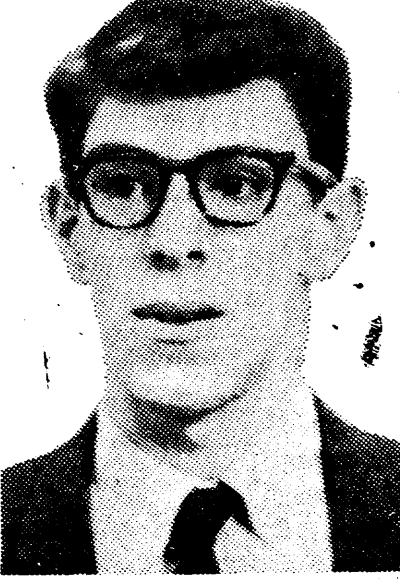
Earned Bloom's Respect